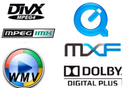
Supported formats Include

ETERE, the worldwide leader in software solutions for broadcast and media companies, today announced a new Quality Control (QC) solution for file-based workflows, a fully automatic content analysis and verification system able to meet all QC needs required in production, post-production, broadcast and distribution environments.