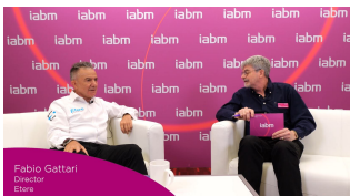
IABM TV at Nabshow 2024