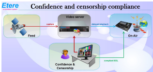
Censorship workflow diagram