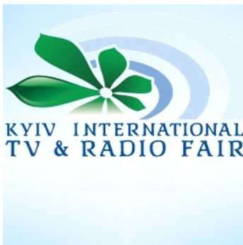
(KYIV International TV & Radio Fair )

Etere will be exhibiting its software solutions at KYIV International TV Radio Fair 2019 that will be held from May 29-30 2019 at Ukraine, Kiev, Kyiv, ACCO International EC. See you there!