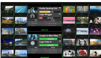
(etx m multiviewer)