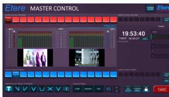
(etere master control)