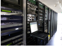
The server room

Etere offers a complete suite of professional services to help your company to manage integrations, improve operational efficiency and to unleash the full benefits of your broadcast and production systems.