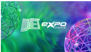
SET Expo 2023

Venue: Booth: 79, Expo Center Norte in Sao Paulo, Brazil