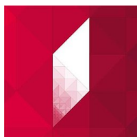
Georgian Public Broadcaster