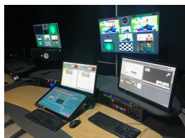
Georgian Public Broadcaster

As a satisfied user of Etere, Georgian Public Broadcasting (GPB) renews its confidence in Etere with an upgrade to the latest Etere 34. GPB is Georgia's national public broadcaster. GPB selected Etere Ecosystem in 2020 to manage its three channels' automated broadcasting, planning, playout, and media assets. This year, GPB upgrades to Etere 34 to leverage the benefits of the new features and to optimise the performance of their system.