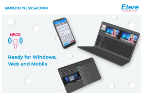
Integrated Nunzio Newsroom