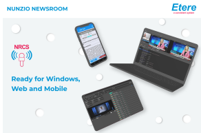
Integrated Nunzio Newsroom

Unlock the power of audio-over-video with our latest update. Broadcasters can now effortlessly add commentaries or narrations, enriching the viewer experience and bringing stories to life. Imagine news channels revealing the "story behind the story" or injecting expert insights during sports coverage—transforming every broadcast with deeper context and engagement. Don't miss out on this game-changing feature!