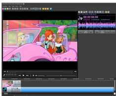
video over - Nunzio