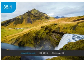
Etere 35.1 Splash Screen