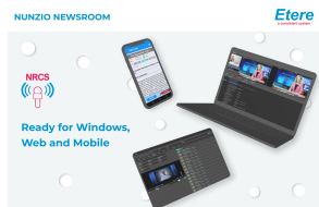
Integrated Nunzio Newsroom