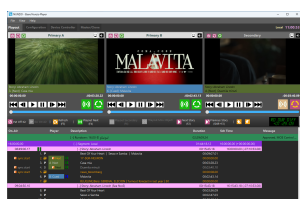
Nunzio Player external graphics

The integration empowers a single operator to effortlessly control both playout and graphics. By consolidating these two essential functions into a single, unified platform, it eliminates the need for multiple systems and reduces the need for additional personnel or resources, ultimately leading to cost savings. This seamless approach not only reduces the complexity typically associated with managing separate systems but also ensures smoother, more efficient operations. With RT Swift Software's cutting-edge tools, operators can easily switch between playout tasks and graphic overlays, making real-time adjustments with minimal effort.