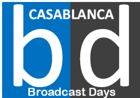
Casablanca Broadcast Days 2025