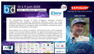
Casablanca Broadcast Days 2025