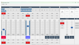
Etere Audio Mixer

Designed to offer the capabilities of a traditional console in a touchscreen-compatible software interface, Etere Virtual Audio Mixer delivers powerful performance without the need for expensive or complex hardware. It streamlines Audio over IP (AoIP) management with an extensive lineup of features, including studio call-in functionality, cue, program, and preview modes, configurable layouts and channel names, dynamic source switching, automatic loudness control, multi-channel management and advanced user presets.