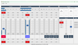
Etere Audio Mixer