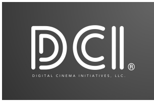
8K Digital Cinema Initiative