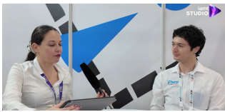
IAMT Studio Interview