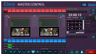
ETERE MASTER CONTROL

The market's most advanced IT-based, cost-efficient video management system is a complete channel in a box with full IP/NDI/SDI in and out capabilities.