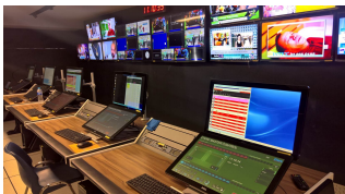
etere master control

Etere ETX is the most advanced, tightly integrated, cost-efficient video management system based entirely on IT technology. It is 4K ready and has a complete channel-in-a-box with full IP/NDI/SDI (in and out) for multiple frame rates. It can drive the most popular HD/SD digital video/audio/graphics platforms without using middleware/proprietary hardware.