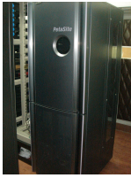
Petasite at HTV

Ho Chi Minh City Television (HTV) is the official television channel of Ho Chi Minh City; currently HTV broadcasts in both analog and digital through two channels: HTV7 for Entertainment & Advertisement and HTV9 for Information & Official Propaganda; HTV also has several specific cable and digital television channels which made of HTV one of the biggest television broadcaster in Vietnam. HTV has relied on Etere the implementation of a Digital Archive and a comprehensive Traffic System on its station. Etere manage all the cutting-edge storage devices provided by its partners, to connect the Archive, Production and Transmission departments, and carry out the entire Media Management as a fully integrated workflow system, which owing to its modular composition, has been successfully incorporated with Etere Traffic, the software that enables HTV to carry out efficient and accurately its entire commercial scheduling.