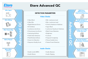
Etere Advanced QC