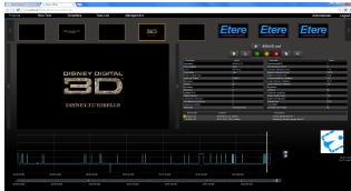
Etere Advanced QC

Etere presents Etere Advanced QC, a video quality check software for Media Asset Management with comprehensive features packaged at an excellent price point.