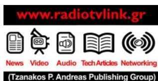
Radio TV Link

ETERE is pleased to announce the release of Loudness Control, the plugin that greatly enhances the capabilities of ETERE Hi-Res Transcoder and enable broadcasters, production houses and media companies to automatically measure and adjust the audio loudness of their media content.