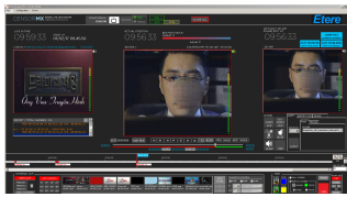
CensorMX Blur Effect