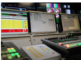
mediaset system 3

Mediaset has upgraded its existing Etere system with an Etere IT based playout provided with MTX technology which has been integrated with the overall solution workflow to manage six Mediaset channels.