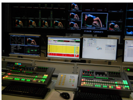
mediaset system 2