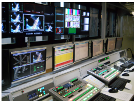
mediaset broadcast system