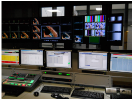
mediaset system 4

Broadcast playlists are combined and fine tuned in Etere Scheduling using Executive Editor.