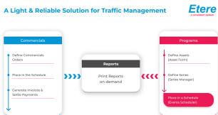
Air Sales Lite Diagram