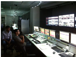
Last Check before go On-Air