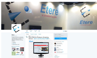
Etere on Twitter