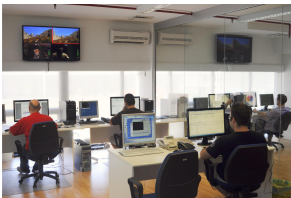
Etere Support Team