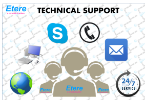
Global Technical Support