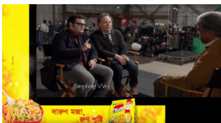
Ad Insertion Squeeze

Etere supports SCTE-35 and SCTE-104 standards to manage Dynamic Ad Insertion (DAI) and Digital Program Insertion (DPI). Benefits include capabilities such as the insertion of graphics, logos, and tickers without changing the broadcast infrastructure. Etere SCTE104 and SCTE35 driver expands video monetization opportunities and allow you to tap advertising opportunities in different markets.