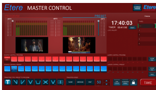
etere master control

Etere Basic Payout features an easy to use and reliable software to broadcast your content to your viewers with a flexible, software-based architecture that enables broadcasters to pay for only what they need and affordably add features as the business evolves.