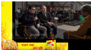
Ad Insertion Squeeze

Etere Live Advertising Player enables dynamic insertion of advertisements in between segments of live content. It enables changes to be made to the list of advertisement as well as the creation of different advertisement lists to cater to different groups of target audiences. Variations of advertisement lists can be prepared in advance to match the encoding profiles of the main broadcast stream. The advertisement content is then delivered via the same method as the live content, leading to a continuous and uninterrupted stream of advertising content delivery.