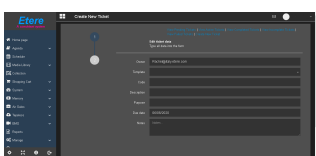
Create a new ticket on Etere Shopping Cart

The Shopping Cart module allows user to create request tickets and includes a set of processes to be performed on assets in order to complete the operations.