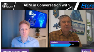
In Conversation with Etere