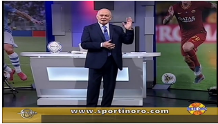
Rete Oro Sports