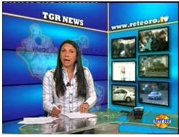
Rete Oro news