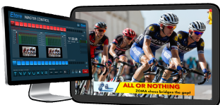
Channel in a box Etere ETX