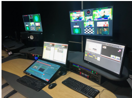
Georgian Public Broadcaster