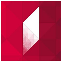
Georgian Public Broadcaster