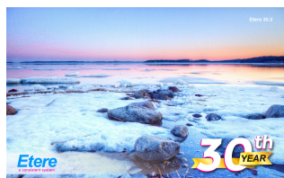
Etere 30.3 wallpaper

Adaptability and future scalability are important considerations when it comes to choosing a system for your business needs. Indonesia's state-owned TV station, Televisi Republik Indonesia (TVRI) upgrades to Etere 30.3 to tap on the latest innovations and to optimise the performance of their broadcast system. The station has been on-air with Etere since 2005. Etere empowers TVRI with a system driven by fully-customisable workflows, enabling their system to be perfectly in tune with their business and operational needs. As part of its customer support contract, Etere provides unlimited software upgrades and updates to meet evolving industry challenges. With a quick and easy software download, you can ensure your system is always ready to run with the latest features.