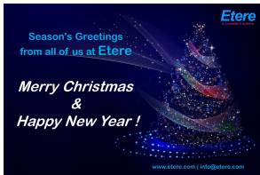
2020 Seasons Greetings from Etere

All of us at Etere would like to wish you a Merry Christmas and a Happy New Year! We'd like to take this opportunity to thank you for your support.