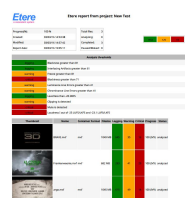
Etere Sample Report

Download the attached Etere Advanced QC powerpoint for a complete list of features and key advantages.