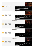
Etere Sample Report