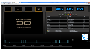
Etere Advanced QC screen