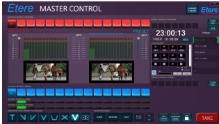
ETERE MASTER CONTROL diagram

Budget Automation empowers broadcasters with the tools needed for the complete management of regional TV stations and small-scale broadcast operations.