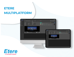
Etere Web Multiplatform