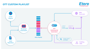
Etere OTT Delivery