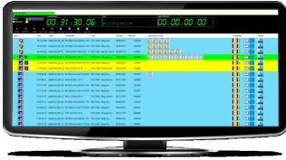
SCTE Signal on scheduling

Smarter, faster and easier. Etere's market proven Over-the-Top (OTT) solutions empowers VTVCab to stay one step ahead of the content delivery evolution with an integrated software solution that manages the end-to-end OTT delivery workflow. Etere has been working with VTVCab since 2014. With the increasing demand for digital content, VTVCab has doubled its OTT channels with Etere as viewership increases and the broadcaster needed a highly efficient system to manage the complete distribution workflow. After a series of evaluations, Etere was selected for its efficient, unified and modular approach.