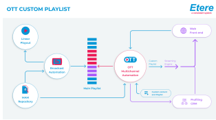
OTT Custom Playlist