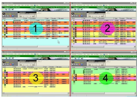
Video Assist - Multi Split View