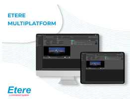
Etere Web Multiplatform

Discover the flexibility of Etere Media Asset Management (MAM) 's multi-language capabilities that bring its software usability to the next-level. As audiences expand their media consumption habits, it is increasingly important for systems to be adaptable to the evolving market demands. Etere allows you to expand your media distribution channels and publish content on multiple platforms, without a change in your software infrastructure.