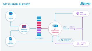
Etere OTT Delivery

Powered by GPU it has a very low CPU impact to deliver multiple streams of multiple resolution and bitrate to match the receiver capabilities for a unique experience.