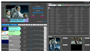
Etere Radio Live

One of the most functional radio payouts in the market, Etere Radio Live releases an all-new web presenter view that enhances the user experience and drives further efficiencies in production, payout, and distribution architectures. Etere releases a feature-rich presenter view that you can access from any web browser. The user-friendly interface simplifies the job of a presenter and allows the presenter to follow the flow of the transmission easily. It features real-time data such as current events, live status, and time remaining to the next event. Web support brings the advantages of accessibility and connectivity from the web. It empowers radio presenters with the information they need on a single interface.