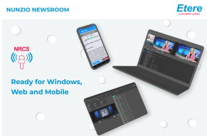
Integrated Nunzio Newsroom

Etere is ready to drive your newsroom to a new level of efficiency with the latest release of an integrated graphics inserter for Etere Nunzio Newsroom. As part of a new release of enhanced features, Etere Nunzio Newsroom allows an effortless insertion of lower thirds, news graphics, and news tickers, without having to incur large Capex costs for under-utilized graphics hardware.