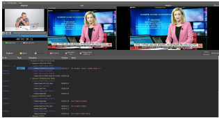
Nunzio Graphics Editor

Etere Nunzio transforms news broadcast with an all-new graphics insertion capability that streamlines the creation and delivery of lower thirds, graphics, and news tickers without any external graphics inserter.