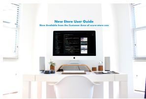
Etere New User Guide

Etere simplifies workflows with a brand new online user guide featuring enhanced accessibility, a user-friendly interface, and faster performance.