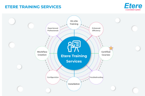
Etere Training Services

Etere training provides professional advice that allows you to maximise benefits and to amplify returns on your investment.