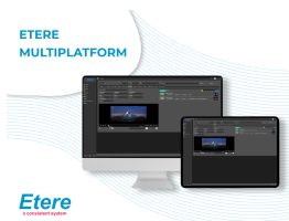
Etere Web Multiplatform

With the new web application, Etere users can add rich metadata to media assets from any web browser. It opens a new level of content management to rediscover new revenue opportunities and boost productivity. The new feature is a part of Etere Media Asset Management (MAM). Etere MAM is an end-to-end software that orchestrates workflows and fully optimizes the value of your assets through centralized management of media content and associated metadata.