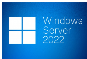
Windows Server 2022